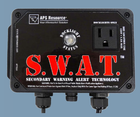
Figure 1: S.W.A.T. device

The S.W.A.T. device is used in conjunction with a vehicle restraint to notify workers that caution should be used at the loading dock. This safety module flashes the positioned dock light when the restraint enters an alarm or warning state.