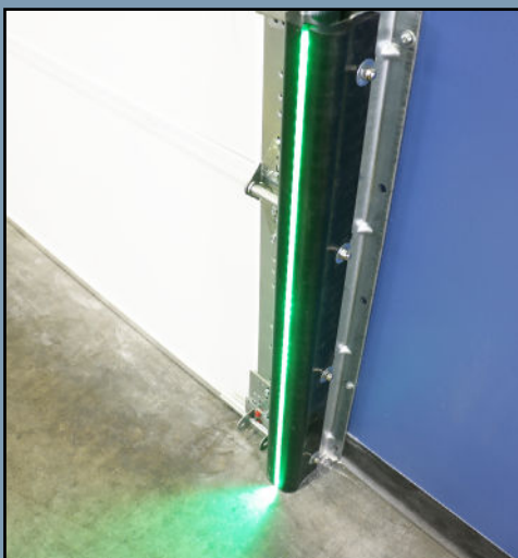
Figure 2: Impact-A-Track LED lowers the risk of door track damage

The Impact-A-Track LED is designed to protect door tracks in high traffic areas of warehouse against forklifts, pallet jacks and other equipment. It can be relied on to communicate restraint status and deflect impacts while utilizing only a small footprint of your active work area. This product comes packaged in a set of two.