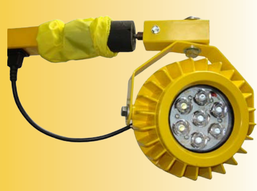
High Impact LED Dock Light on a Spring Arm (Sold Separately)