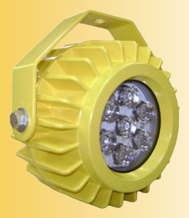
Heavy-duty High Impact LED Dock Light Head

The High Impact LED™ Dock Light from APS Resource is designed for your most demanding applications at the loading dock. The rugged, cast aluminum housing with poly-carbonate lens is engineered to withstand impact at the loading dock without damage to the light. Bright, energy efficient 18 watt LED with 60,000 hour lamp life saves on utility, maintenance and replacement costs. The High Impact LED Dock Light can be easily retrofitted to existing dock arms or can be mounted remotely.