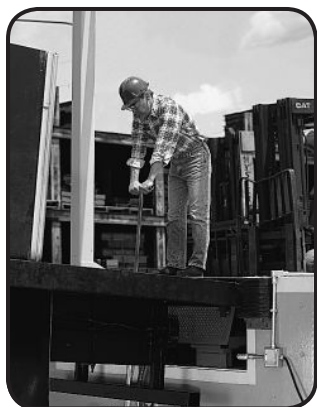
Dock worker uses push bar to activate and release