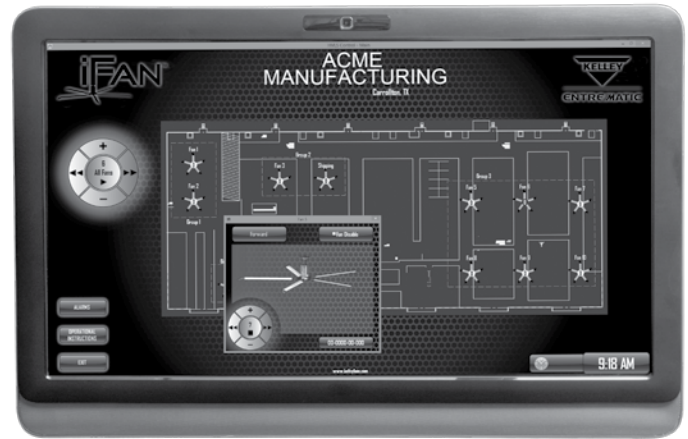
Dialog box for individual fan provides access to direction and speed settings for a specific fan.