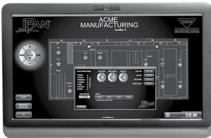
Timer setting dialog box enables direction and speed for individual HVLS fan or zones to be set by time of day.